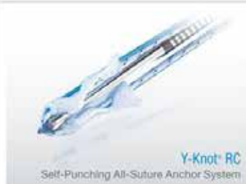
Y-Knot ™ RC Self-Punching All-Suture Anchor System