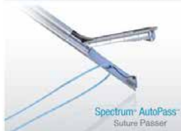
Spectrum ™ AutoPass ™ Suture Passer