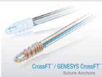
CrossFT ™ / GENESYS CrossFT ™ Suture Anchors