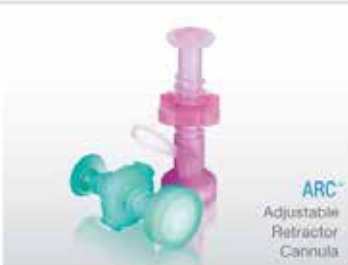
ARC ™ Adjustable Retractor Cannula