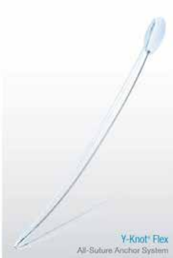
Y-Knot ™ Flex All-Suture Anchor System