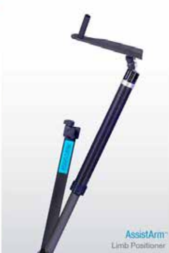
AssistArm ™ Limb Positioner