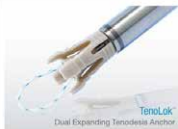
TenoLok ™ Dual Expanding Tenodesis Anchor