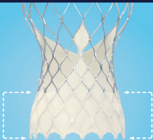
Evolut™ PRO TAVI System